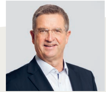
Oliver Zipse Chairman of the Board of Management of BMW AG